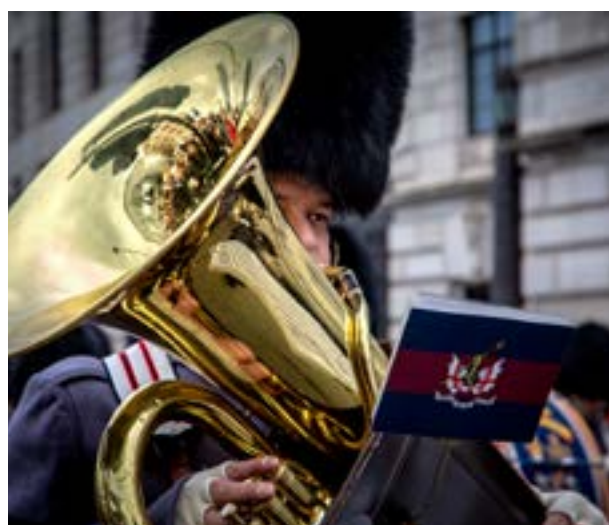
5. Playing to the Crowd by Bill Bilbe