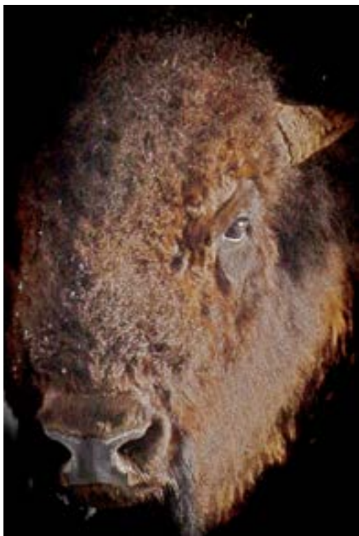
The Look of a Wild Bison by Bill Bilbe