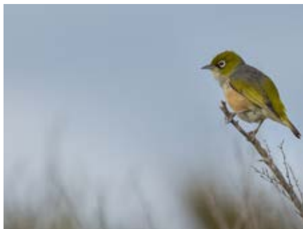
2. Zosterops Lateralis by Karl Trethaway