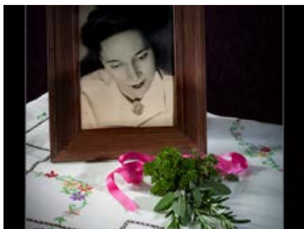
5. She once was a true love of mine by Albany Bilbe