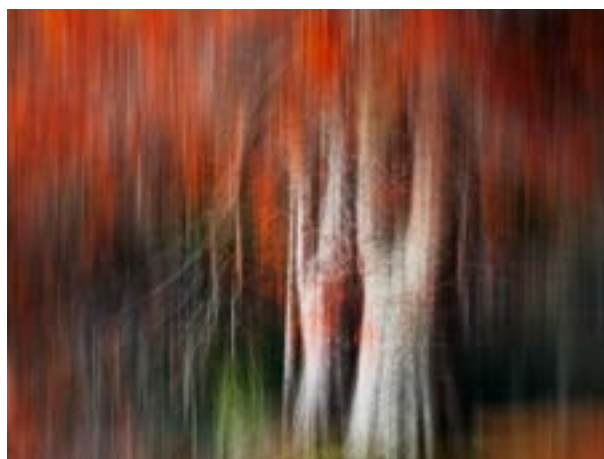
6. Autumn