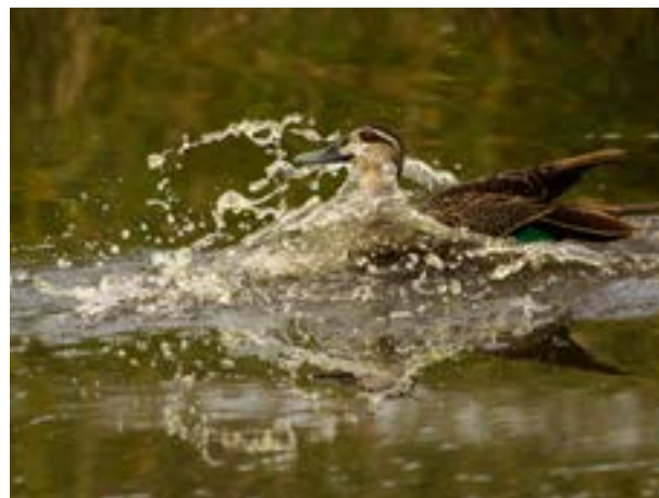
6. Splash by Jeannette Nee