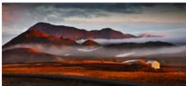
3. Last Light in Iceland by Lorraine Jones