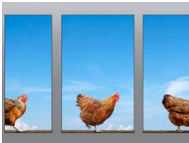
4. The Girls by Gill Hodgson