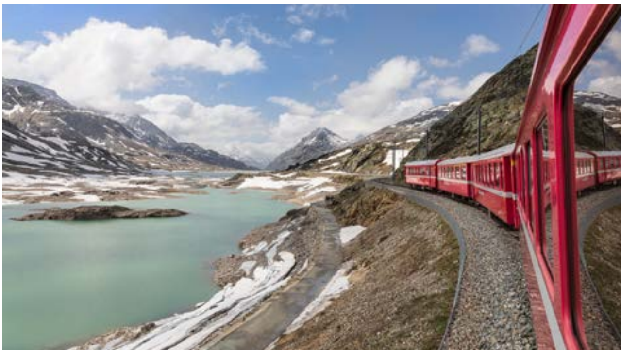
All aboard the Bernina Express

Nothing new this month as January had no submissions. But here's a couple of other good ones from 2018, again, both achieved "Honours".